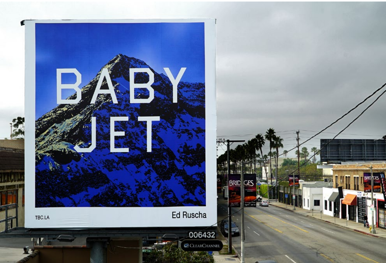
Photo: Ed Ruscha's 2015 Billboard at Melrose and Wilton

With submissions and donations increasing each year, the all-volunteer staff works tirelessly to provide opportunities for artists to share their work with the largest audience possible. Operating on a blind submission model, the selection process strives to represent the broad spectrum of the Los Angeles art scene.