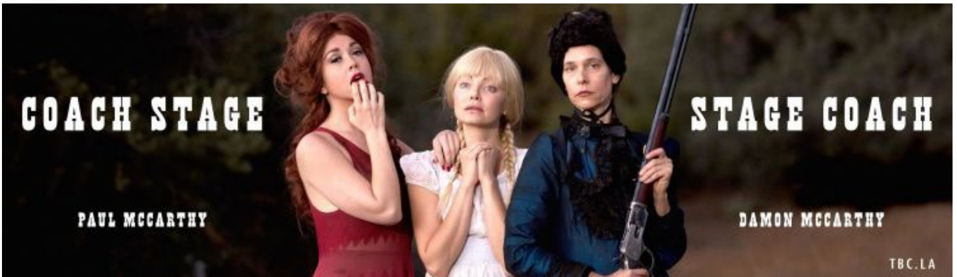
Photo: Paul McCarthy's 2016 Billboard

This year, TBC is honored to announce collaborations with two renowned artists: Paul McCarthy and Alex Prager. McCarthy will bring his critical analysis of mass media and consumer-driven society to TBC's curatorial process. An artist who is inspired by American pop culture and often manages to whip up controversy with his larger-than-life works, McCarthy will push the project further and encourage commuters to engage with the exhibition. Both McCarthy and Prager live and work in Los Angeles, and their connection to the community will help TBC to reach the underbelly of LA culture, representing both established and emerging artists. Prager's meticulous approach, hyperreal film-like compositions, and fictive realities are a perfect match with the unique medium of billboards--breaking up the monotony of city thoroughfares with a refreshing dose of contemporary art.